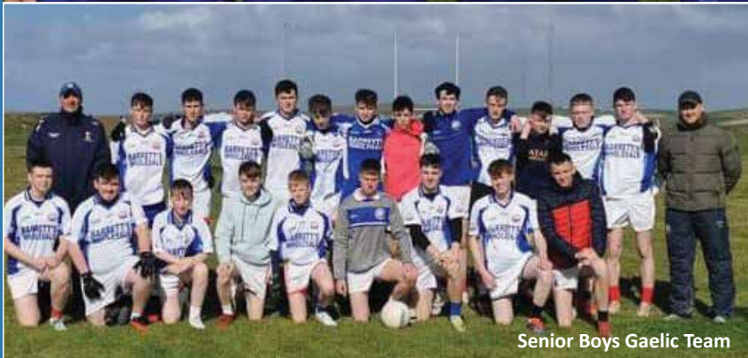
Senior Boys Gaelic Team