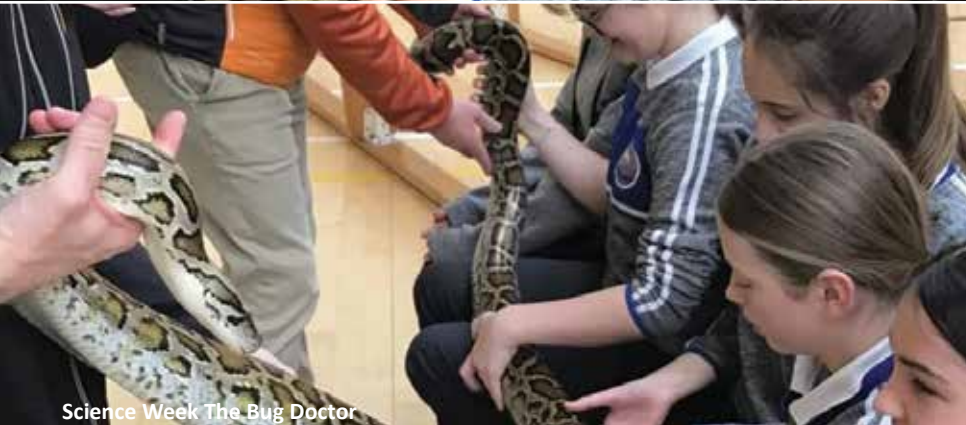
Science Week The Bug Doctor