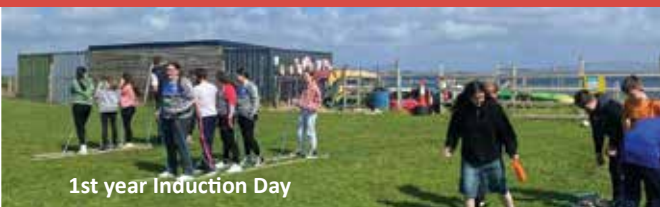
1st year Induction Day