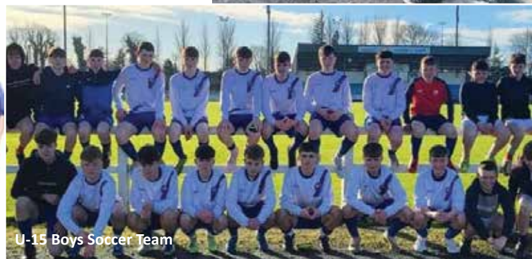
U-15 Boys Soccer Team