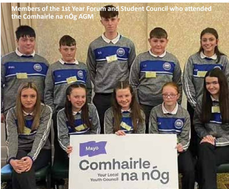
Members of the 1st Year Forum and Student Council who attended the Comhairle na nÓg AGM

At Junior Cycle all subjects are offered at Higher, Ordinary and Foundation Level where feasible.