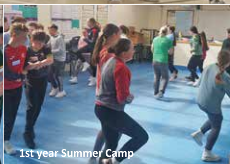
1st year Summer Camp