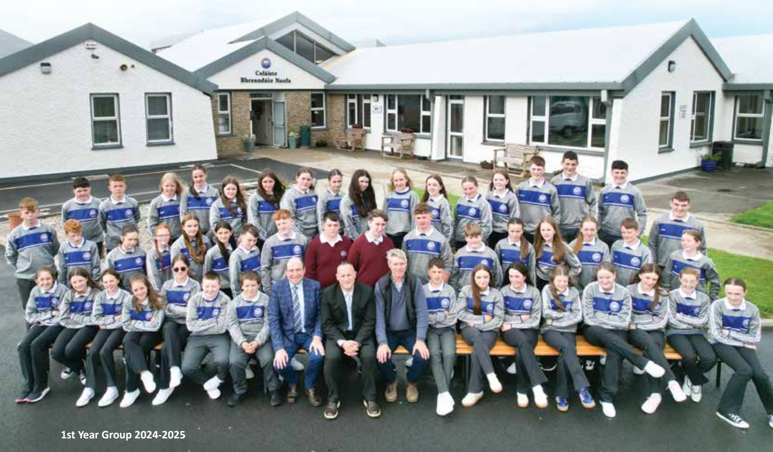
1st Year Group 2024-2025