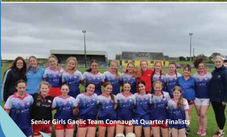
Senior Girls Gaelic Team Connaught Quarter Finalists