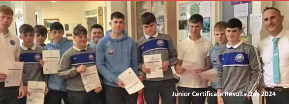
Junior Certificate Results Day 2024