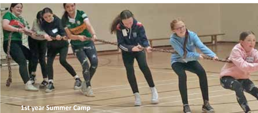
1st year Summer Camp