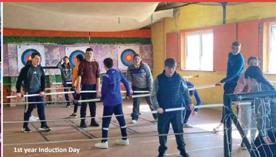
1st year Induction Day