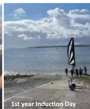
1st year Induction Day