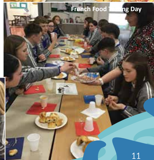
French Food Tasting Day