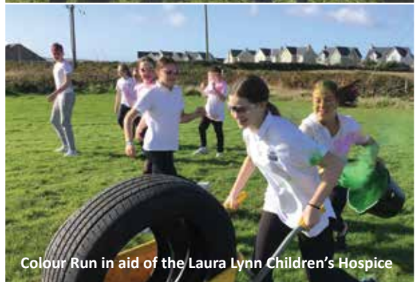
Colour Run in aid of the Laura Lynn Children's Hospice