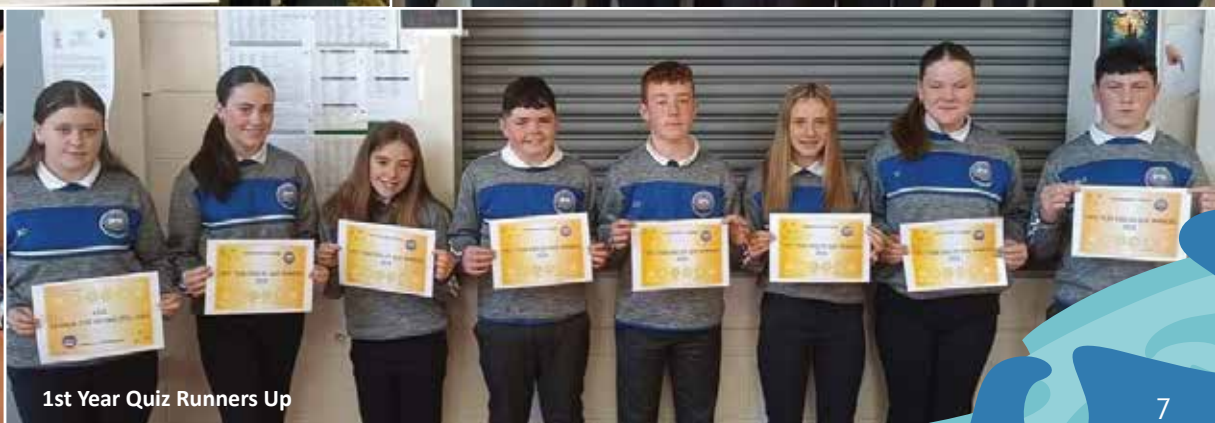
1st Year Quiz Runners Up