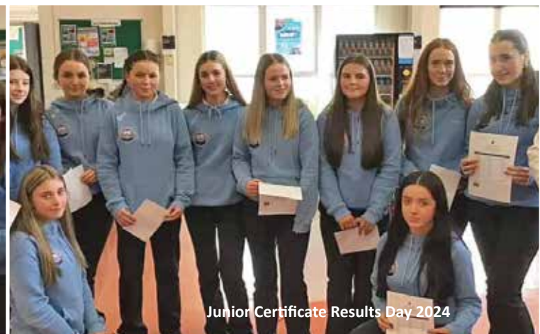
Junior Certificate Results Day 2024