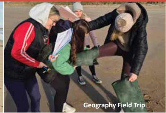
Geography Field Trip