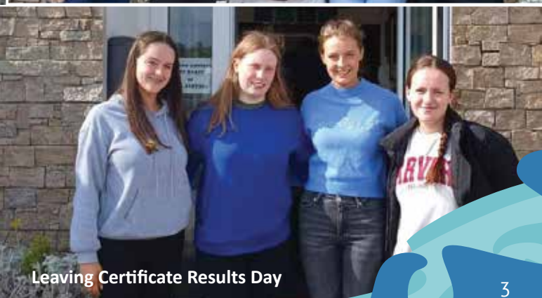
Leaving Certificate Results Day