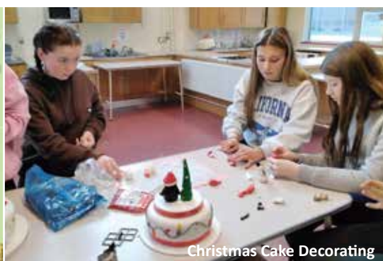
Christmas Cake Decorating