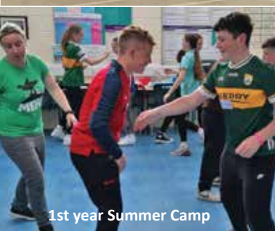
1st year Summer Camp