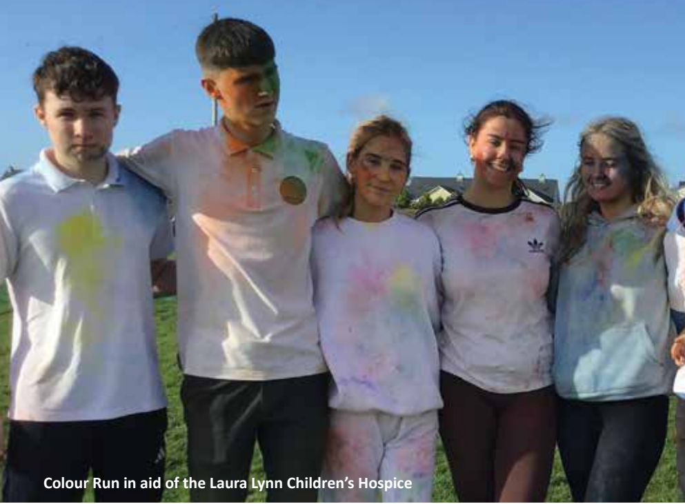
Colour Run in aid of the Laura Lynn Children's Hospice