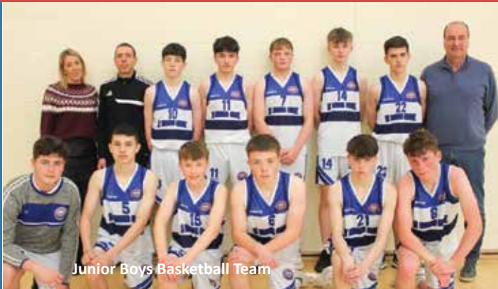
Junior Boys Basketball Team