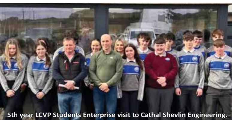
5th year LCVP Students Enterprise visit to Cathal Shevlin Engineering.

Where feasible we are prepared to change the subject choice to meet the needs and demands of students.