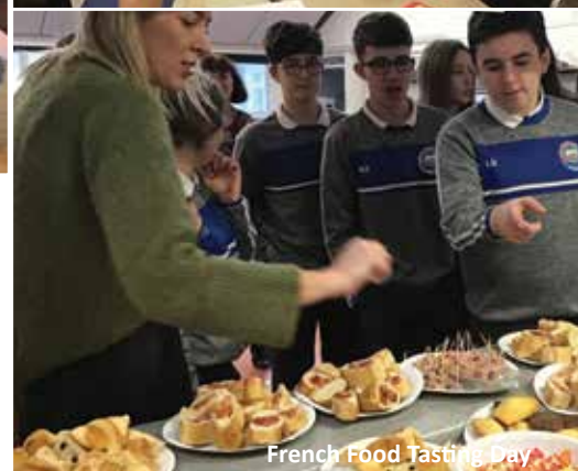
French Food Tasting Day