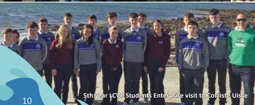
5th year LCVP Students Enterprise visit to Colaiste Uisce