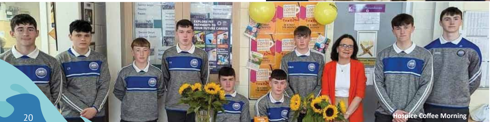
Hospice Coffee Morning