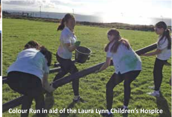
Colour Run in aid of the Laura Lynn Children's Hospice