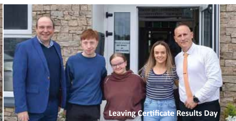
Leaving Certificate Results Day