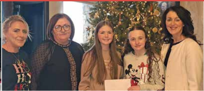
Transition year and First year Mini-Companies attending the Cara Iorrais Christmas Markets