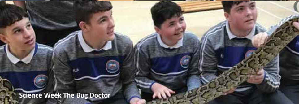
Science Week The Bug Doctor