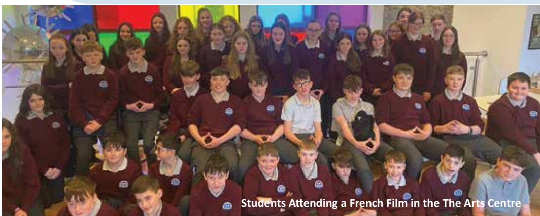
Students Attending a French Film in the The Arts Centre

A tradition of excellent Junior Certificate and Leaving Certificate results exists in St. Brendan's College. Our past pupils have excelled in a wide variety of careers and third level courses. These achievements range from winning University Scholarships to National Apprenticeship Awards.