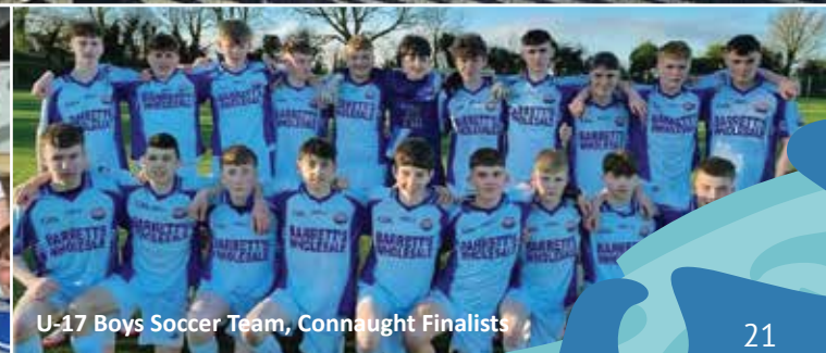
U-17 Boys Soccer Team, Connaught Finalists