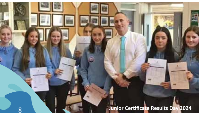
Junior Certificate Results Day 2024

Science is also a core subject because a science subject is essential for careers in medical, engineering and scientific fields.