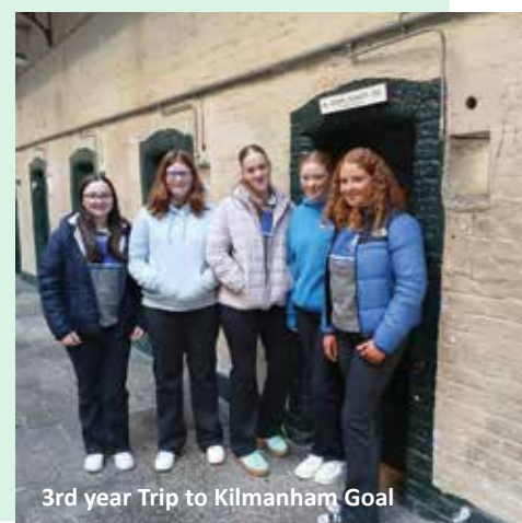
3rd year Trip to Kilmanham Goal

The school is greatly indebted to teachers who give so generously of their time and expertise in the promotion of these activities on a voluntary basis.