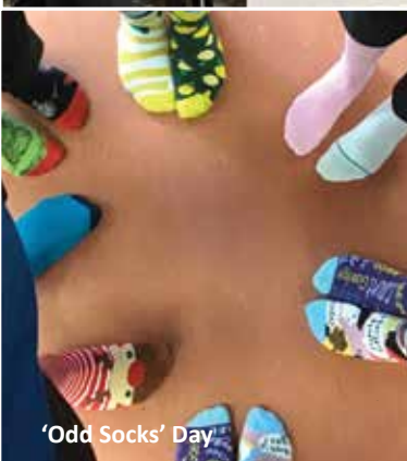
'Odd Socks' Day