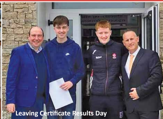
Leaving Certificate Results Day