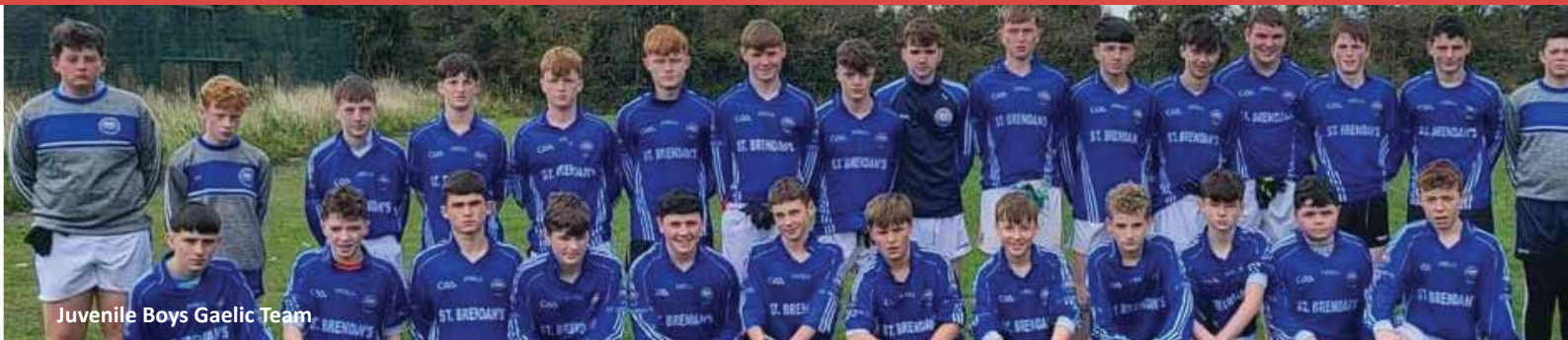
Juvenile Boys Gaelic Team