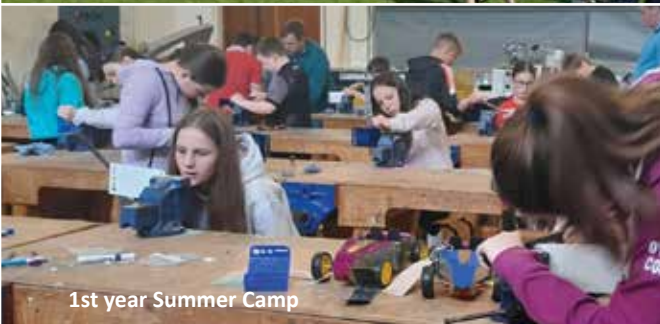
1st year Summer Camp