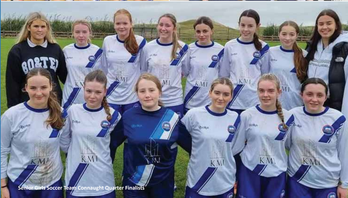
Senior Girls Soccer Team Connaught Quarter Finalists