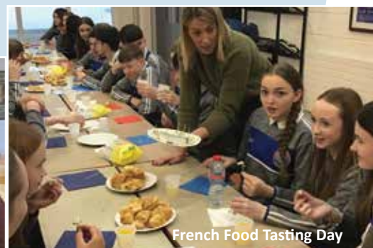
French Food Tasting Day