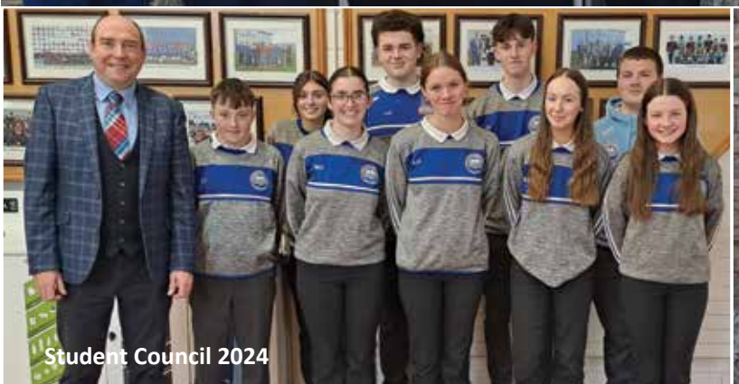
Student Council 2024