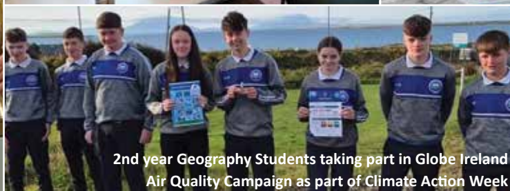
2nd year Geography Students taking part in Globe Ireland Air Quality Campaign as part of Climate Action Week