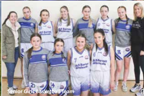
Senior Girls Basketball Team