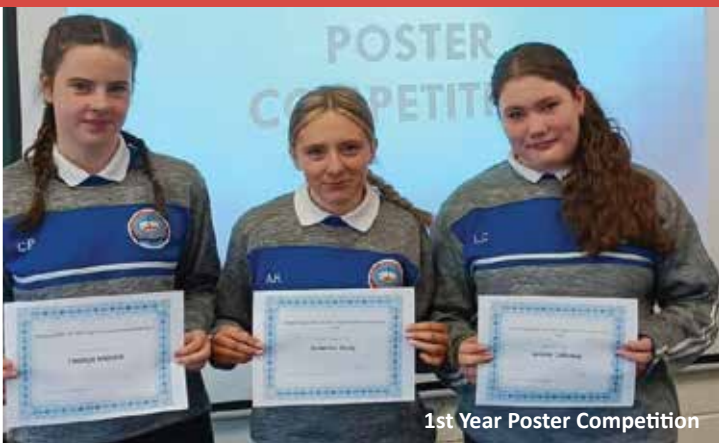
1st Year Poster Competition