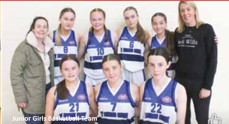
Junior Girls Basketball Team