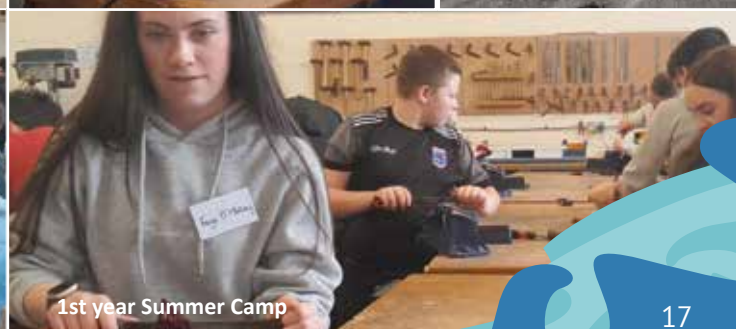
1st year Summer Camp