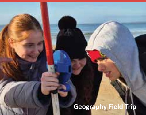
Geography Field Trip