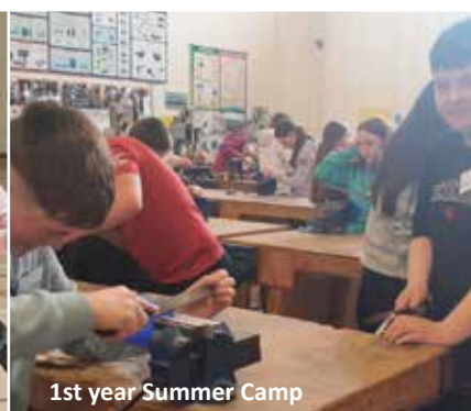
1st year Summer Camp