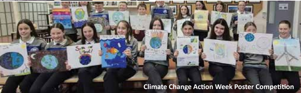
Climate Change Action Week Poster Competition