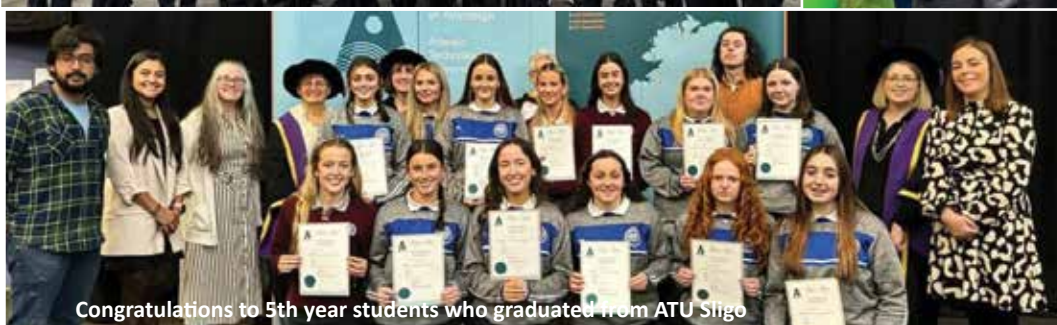
Congratulations to 5th year students who graduated from ATU Sligo