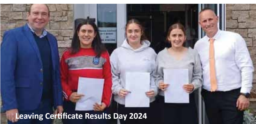
Leaving Certificate Results Day 2024

St. Brendan's College is under the Management of Mayo, Sligo, Leitrim ETB and the School Board of Management.