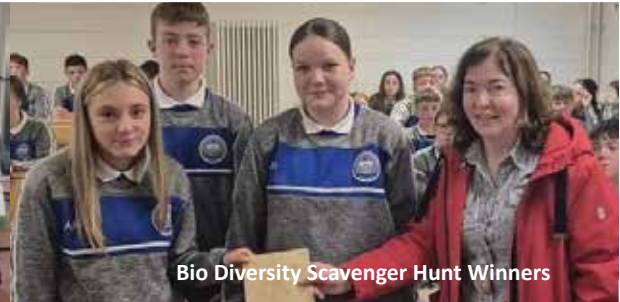
Bio Diversity Scavenger Hunt Winners