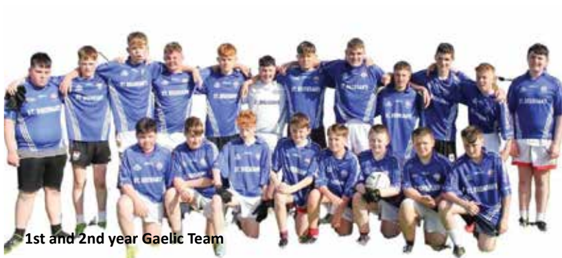
1st and 2nd year Gaelic Team