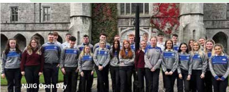
NUIG Open Day

Every individual is a valued member of our college community and, through the provision of a comprehensive guidance and counselling curriculum; we ensure that they are given every opportunity to develop to their fullest potential. Our academic performance is excellent, with the vast majority of students entering third level education annually. In pursuit of academic excellence, we never lose sight of the individuality of each student in our care. Our level of care and support for students is unparalleled. Students of St. Brendan's College thrive because they are supported, encouraged, cared for and feel a real sense of belonging.