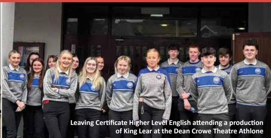
Leaving Certificate Higher Level English attending a production of King Lear at the Dean Crowe Theatre Athlone