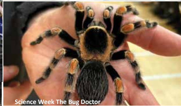
Science Week The Bug Doctor