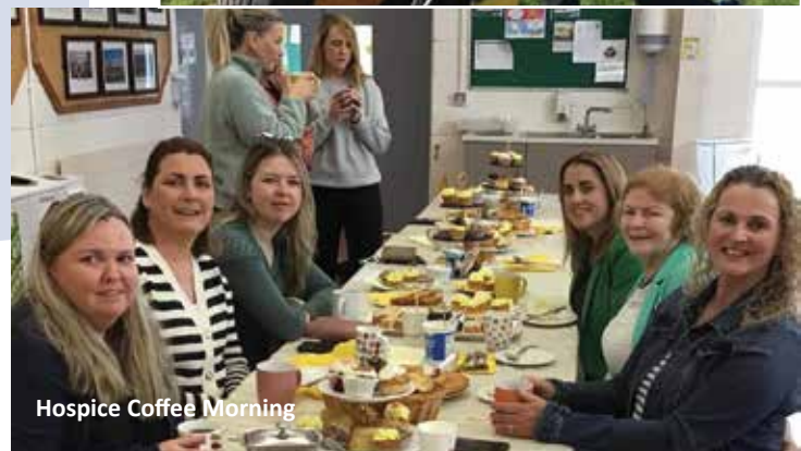
Hospice Coffee Morning