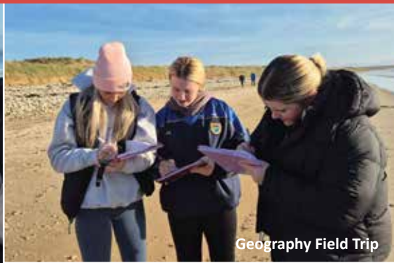
Geography Field Trip