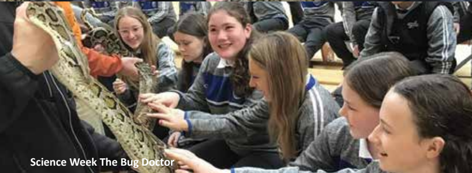
Science Week The Bug Doctor