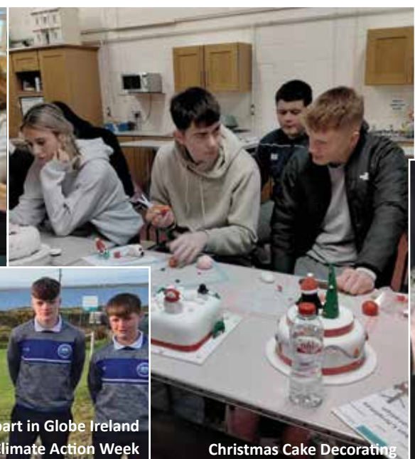
Christmas Cake Decorating