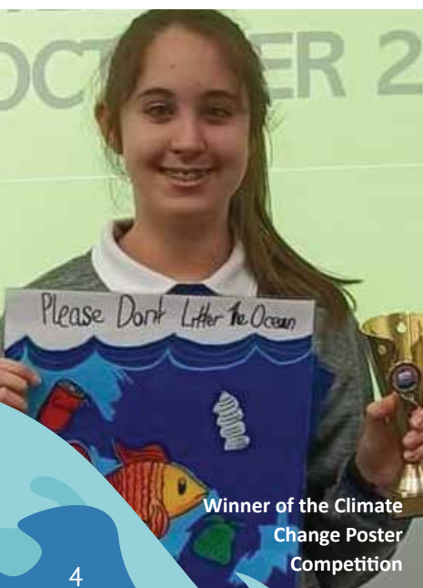
Winner of the Climate Change Poster Competition

Maroon V. neck jumper or new crew neck jumper