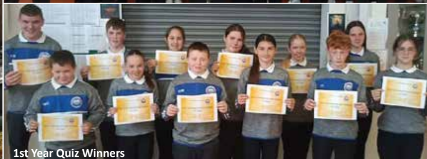
1st Year Quiz Winners