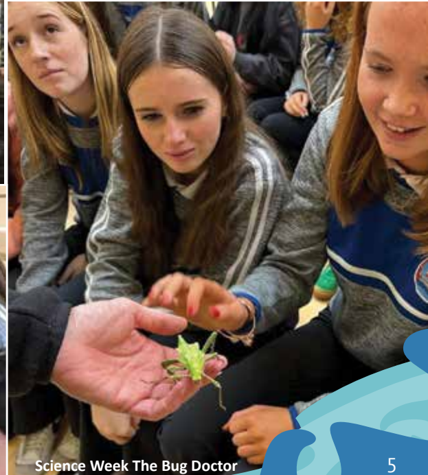
Science Week The Bug Doctor