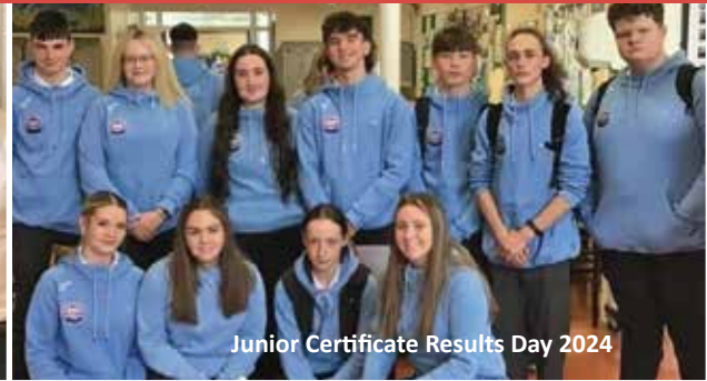
Junior Certificate Results Day 2024